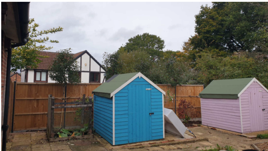
Recently re-planted vegetation.