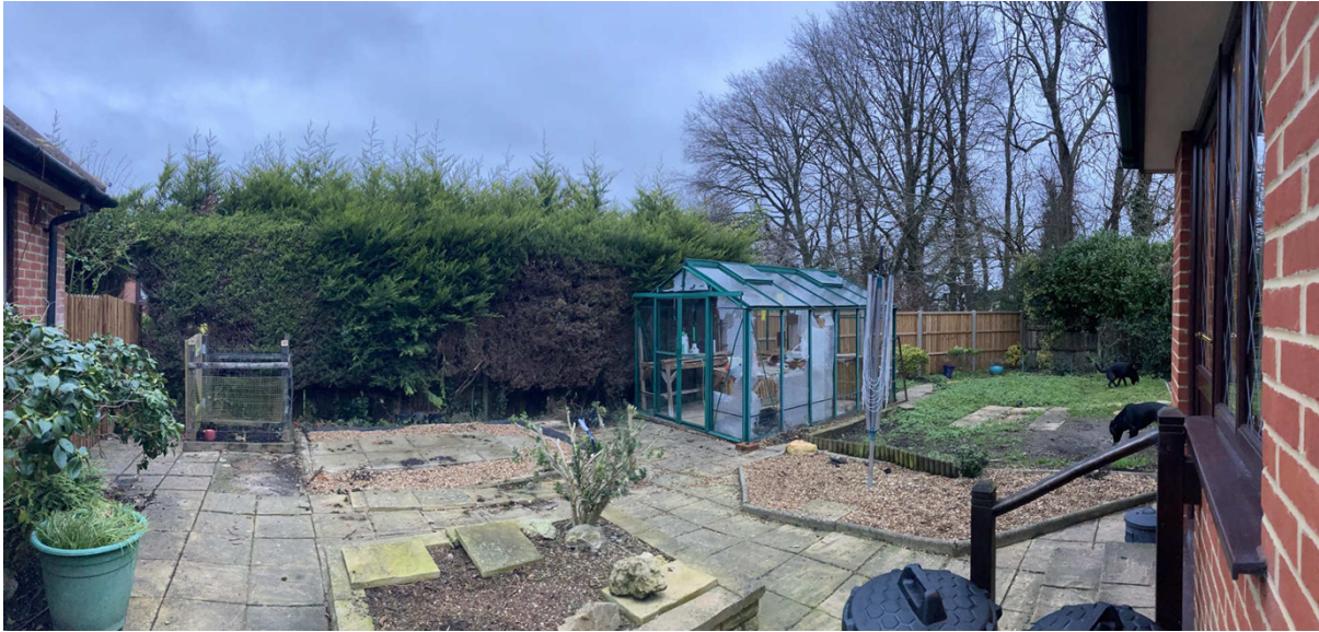
Anticipated height of re-planted vegetation once fully grown.